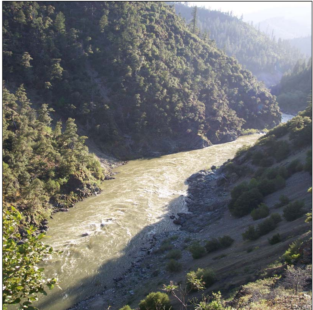
U.S. Bureau of Reclamation

The Solicitor of the Department of the Interior has issued opinions that conclude that the tribes in fact hold water rights for Klamath River flows, with 19 th -century priority. The scope of any such rights is of course a matter of debate.